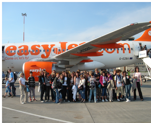
After the landing...

But, fortunately, all of people left France... I was scared for the take-off and the landing, but, in general, the travel happened great, and we landed at 5:25 pm in Liverpool.