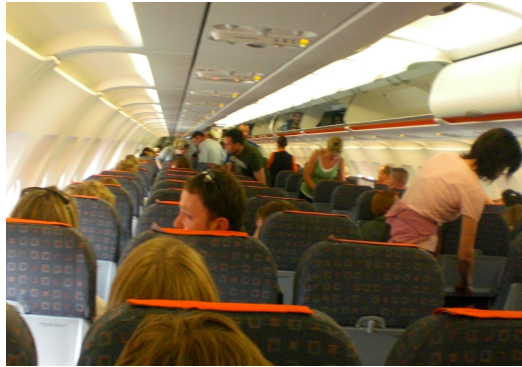
During the travel...